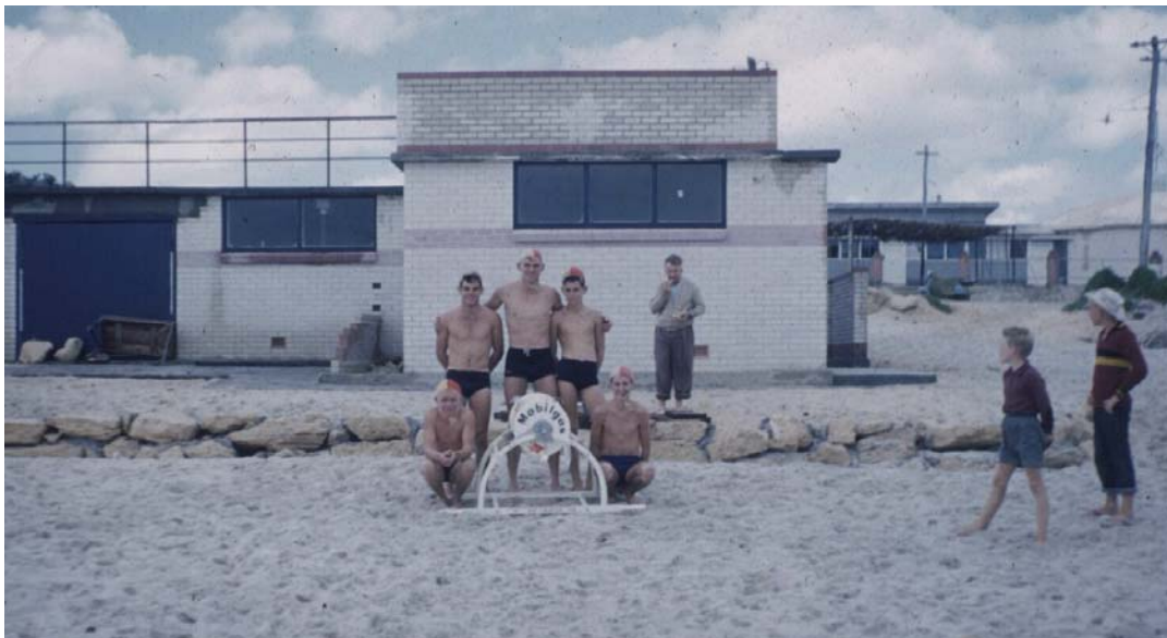
Sorrento SLSC 1960

The Committee's first major task was to secure clubrooms. There wasn't a government committee to apply to for the money as later Board of Managements have done for funding. Their only option was to go to the then "Commissioner of the Wanneroo Roads Board". The committee wrote a letter in 14 th October 1959 requesting urgent funding for the amount of £1259($ 2500) for the building program! The actual cost to the WRB would be far less as £500 would be a grant from the Lotteries Commission, the club would donate £250 and £180 would be provided in the form of free labour and supervision. The actual cost to the WRB would be £329 ($660)!