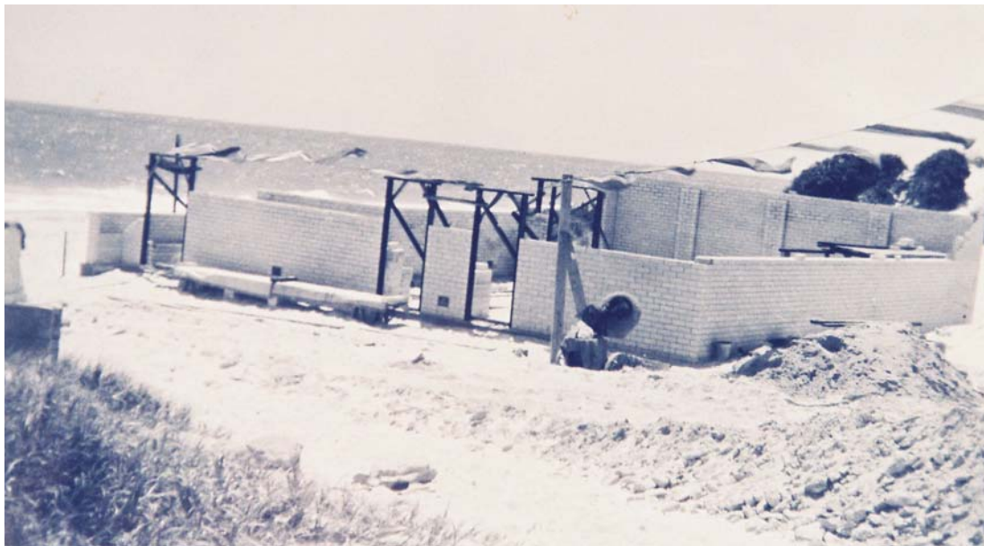
Construction of Sorrento SLSC 1960